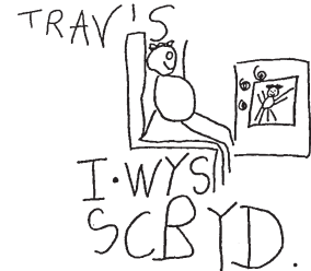
"I watched Scooby Doo."