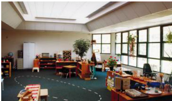
Effective Daylighting strategies reduce both lighting and cooling loads.